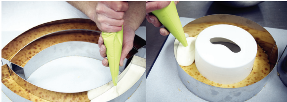
3 | Filling