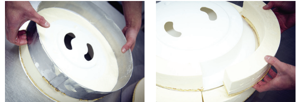
4 | Unmolding